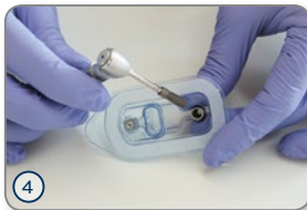
④ Insert screwdriver directly into the implant and remove