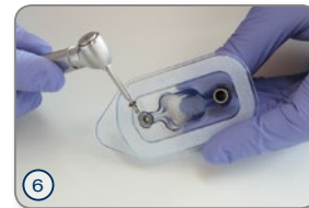
⑥ Remove cover screw via screwdriver