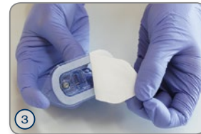
③ Remove Tyvek foil from the inner blister