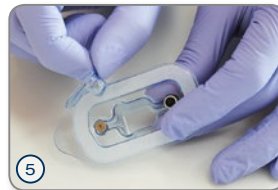
⑤ Take off protective cover for cover screw